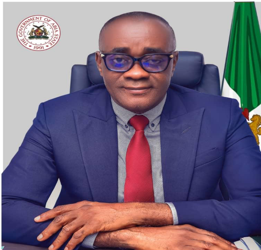
ELDER GOODLUCK CHINEDU UBOCHI HON. COMMISSIONER FOR BASIC AND SECONDARY EDUCATION